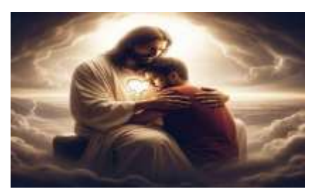
LOVE YOUR ENEMIES

SEVENTH SUNDAY IN ORDINARY TIME YEAR C 23rd February, 2024